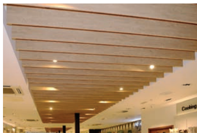
Bespoke Manufacture & Finishing Service