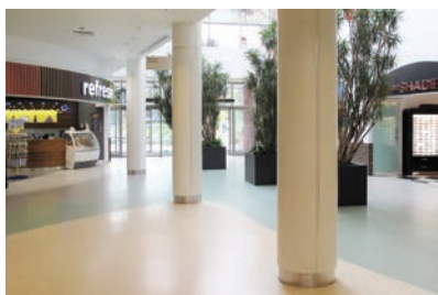
Column Casing Solutions