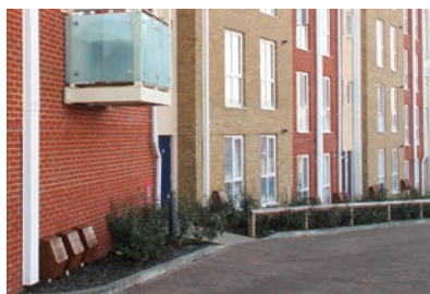
Metal Pipe Boxings