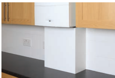
Boiler Pipe Boxings