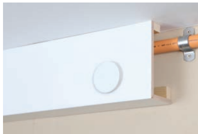
Flame Retardant Sprinkler Boxings