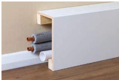
Pipe & Fire Sprinkler Boxings