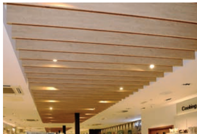
Bespoke Manufacture & Finishing Service