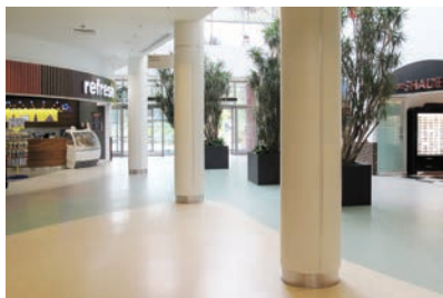
Column Casing Solutions